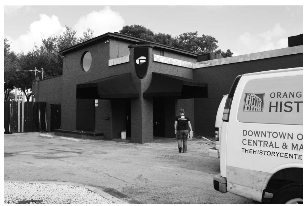
History Center staff beginning to collect artifacts from inside Pulse Nightclub after its release from the FBI.

Greater Orlando, had been in the planning stages for months when the shooting occurred. With a scheduled opening date in October, we took action to design a twenty-foot wall to honor the murdered, incorporating a small selection of powerful memorial objects. The following June, our Spanish-English bilingual, one-year remembrance exhibition, One Year Later: Reflecting on Orlando's Pulse Nightclub Massacre, filled 3,200 square feet.